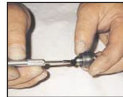
Step-5. Use the 3/16-in. end brush to clean the inside of the fluid tip.