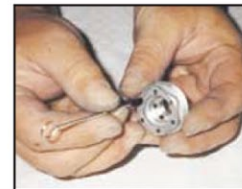
Step-8 and 9. A brush in the same kit is also used to clean all the air holes in the baffle (front and back). Wipe your needle and lubricate. Be sure to lubricate the needle packing, air valve and trigger stud. The best time for this procedure is a Friday afternoon so your equipment is ready for use at the start of the next week.