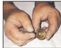
Step-4. Using the same kit, clean the air horns of the cap (front and back).