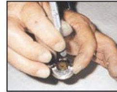
Step-2. Locate the needle in your seven piece needle set that fits the air holes in the face of the air cap and make sure they are open.