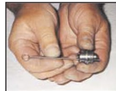
Step-7. The same kit is used for cleaning all the air holes in the fluid tip.