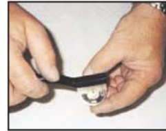
Step-1. Start by brushing the outside of the air cap using the GP brush.