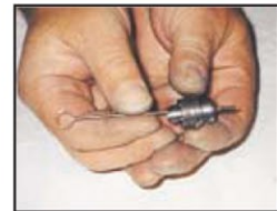
Step-6. Using the five-piece mini brush kit, clean the needle seat (center hole) of the fluid tip.