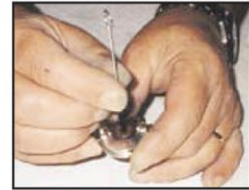
Step-3. Locate the appropriate brush in the five-piece mini brush kit and clean the center hole of the air cap (fluid passage).